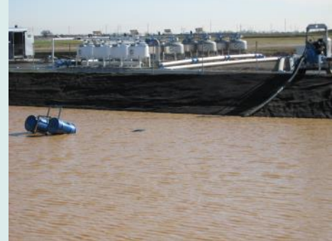
ATS Prides itself in being a solution-based service provider. We make water quality our business, so you can focus on yours!